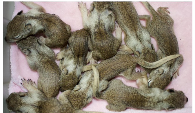
Baby California Ground Squirrels