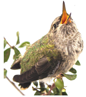
Baby Anna's Hummingbird