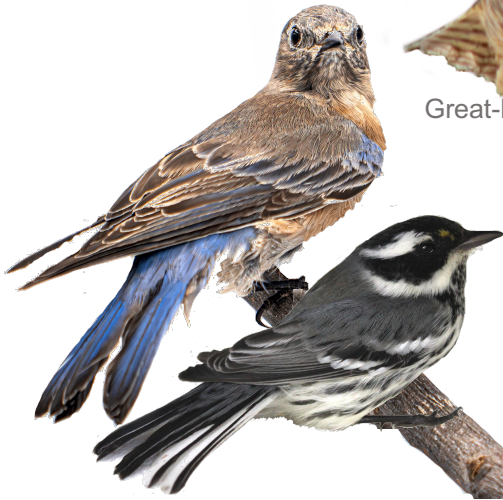
Western Bluebird and Black-Throated Grey Warbler